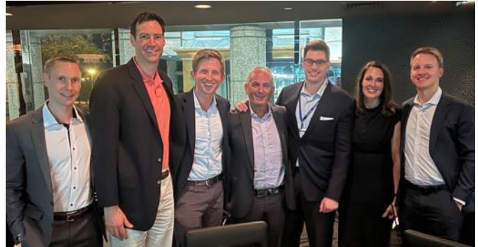
Shoulder and Sports Fellows at ASES 2022

Over the course of their fellowship year, the Shoulder & Elbow Fellow will have the opportunity to attend a variety of national and regional courses and meetings: