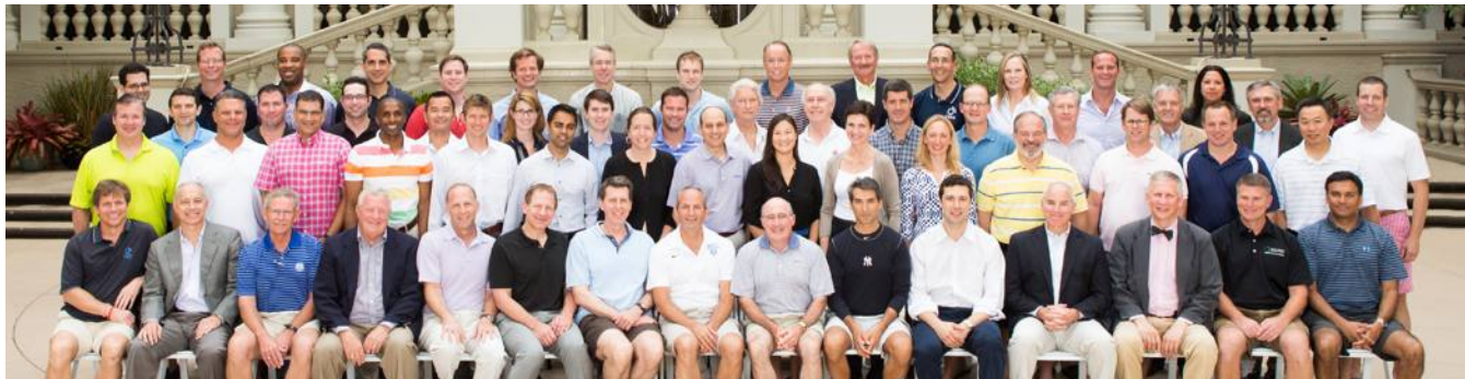
Members of the Columbia Shoulder Society at the 2013 Biennial Meeting