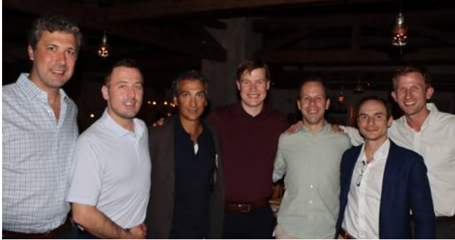
Fellows graduation dinner 2022