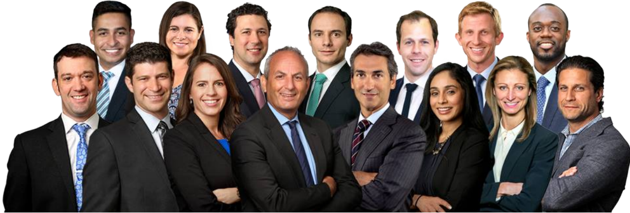
Attending faculty of the Columbia University Division of Shoulder, Elbow, & Sports Medicine

The Shoulder & Elbow Fellowship is recognized as a non-ACGME ASES-accredited fellowship, and the fellow is credentialed as an NYP attending, capable of operating independently within the NYP/Columbia hospital system. It is expected that the Shoulder & Elbow Fellow will cover the Vanderbilt Shoulder Clinic and schedule operative cases to be performed alone as the primary surgeon depending on case complexity. This credentialing will include malpractice insurance, fringe benefits, and expense coverage for appropriate licensure. The Shoulder & Elbow Fellow will be expected to bill as an Assistant Surgeon when applicable, or as Primary Surgeon when appropriate. It is expected that the fellow perform the clinical duties of an Attending Orthopedic Surgeon: providing clinical care for patients in the outpatient clinic and hospital settings, including rounding, documentation, and resident & student teaching. The Shoulder & Elbow Fellow will be considered an integral team member of the primary faculty's private practice.